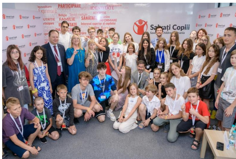
Refugee children from Ukraine meet with decision makers at Save the Children’s Counselling and Integrated Services Centre in Bucharest.

This summer, Save the Children hosted the “Young Voices of Ukraine - Children’s Participation Forum” a consultation event dedicated to refugee children from Ukraine. Over 270 children, aged 9 to 17, participated in consultations events across Bucharest, Baia Mare, Constanța, Galați, Iași, Năvodari, Suceava, Timișoara, and Tulcea. They discussed were informed about their rights, including the right to participate, identified main problems related to their education and wellbeing, and brainstormed for possible solutions. Locally they met with authorities to test their proposals, and to better understand the opportunities and limitations.