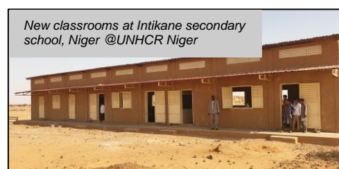
New classrooms at Intikane secondary school, Niger @UNHCR Niger