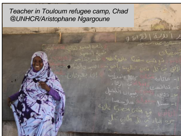
Teacher in Touloum refugee camp, Chad

Since the start of the Covid-19 pandemic, increased support has been provided to teachers in refugee camps in Chad, both during the period of school closure to ensure continuity of learning for students, and after school reopening to ensure a safe return to classes .