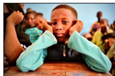
Student in a new classroom in Timbuktu, Mali @UNHCR Mali

In Niger , UNHCR has increased the capacity of the secondary school in the refugee reception area of Intikane , in the Tahoua region, by building three new classrooms to accommodate the new arrivals.